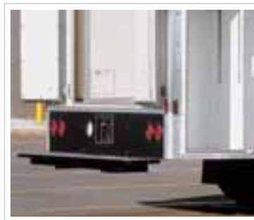
Standard low 10" pooched bumper for non-slip safety