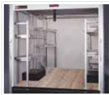
Optional full-length adjustable shelves for increased storage