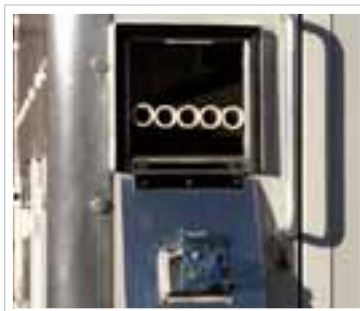
Rear pipe door for easy loading, storage, and quick access to long items like PVC or copper pipe