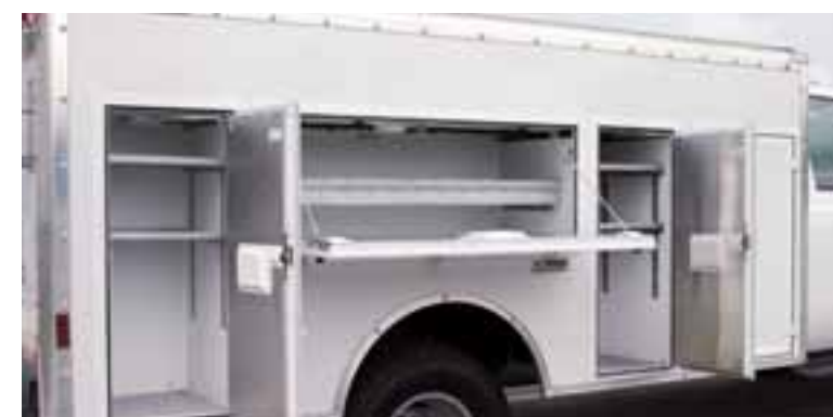
Driver's side or curbside—we'll tailor a truck with compartments to meet your needs.