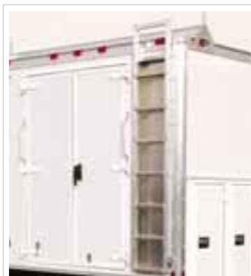
Rear-access ladder to roof offers easy access to ladder rack

Due to Supreme Corporation's commitment to product quality, specifications and options are subject to change in the interest of product improvement.