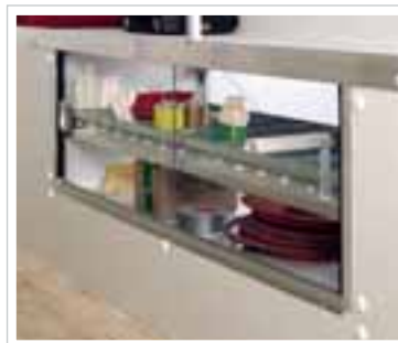
Sliding, reach-through, Plexiglas door into horizontal compartments offers see-through, easy access to your tools