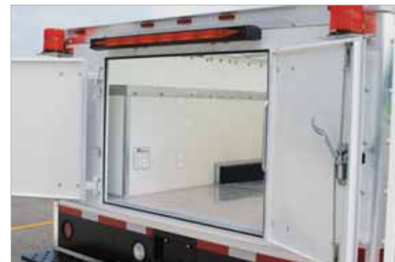
Supreme will custom build to your business needs

Supreme Truck Bodies of CA/Vallejo Mare Island Bldg. 853 California Ave. • Vallejo, CA 94592 • 707-562-3939